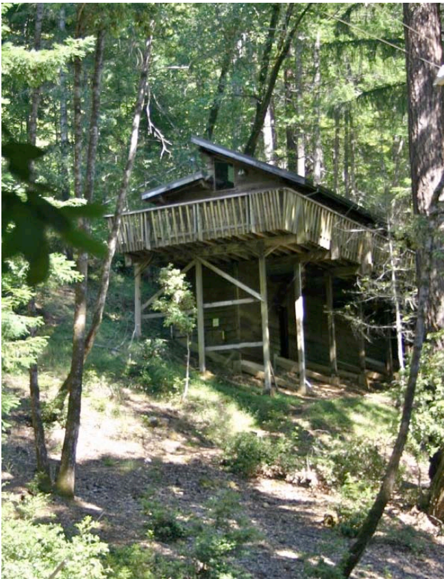
North Star Lodge Sleeps 20 with 4 bunk rooms.

The reason meals are only $3 per person per meal is that they will be prepared by families that attend. There will be some wonderful food served, prepared from favorite recipes. If you have special dietary needs, tell Reservations about them when you call to book your room(s).